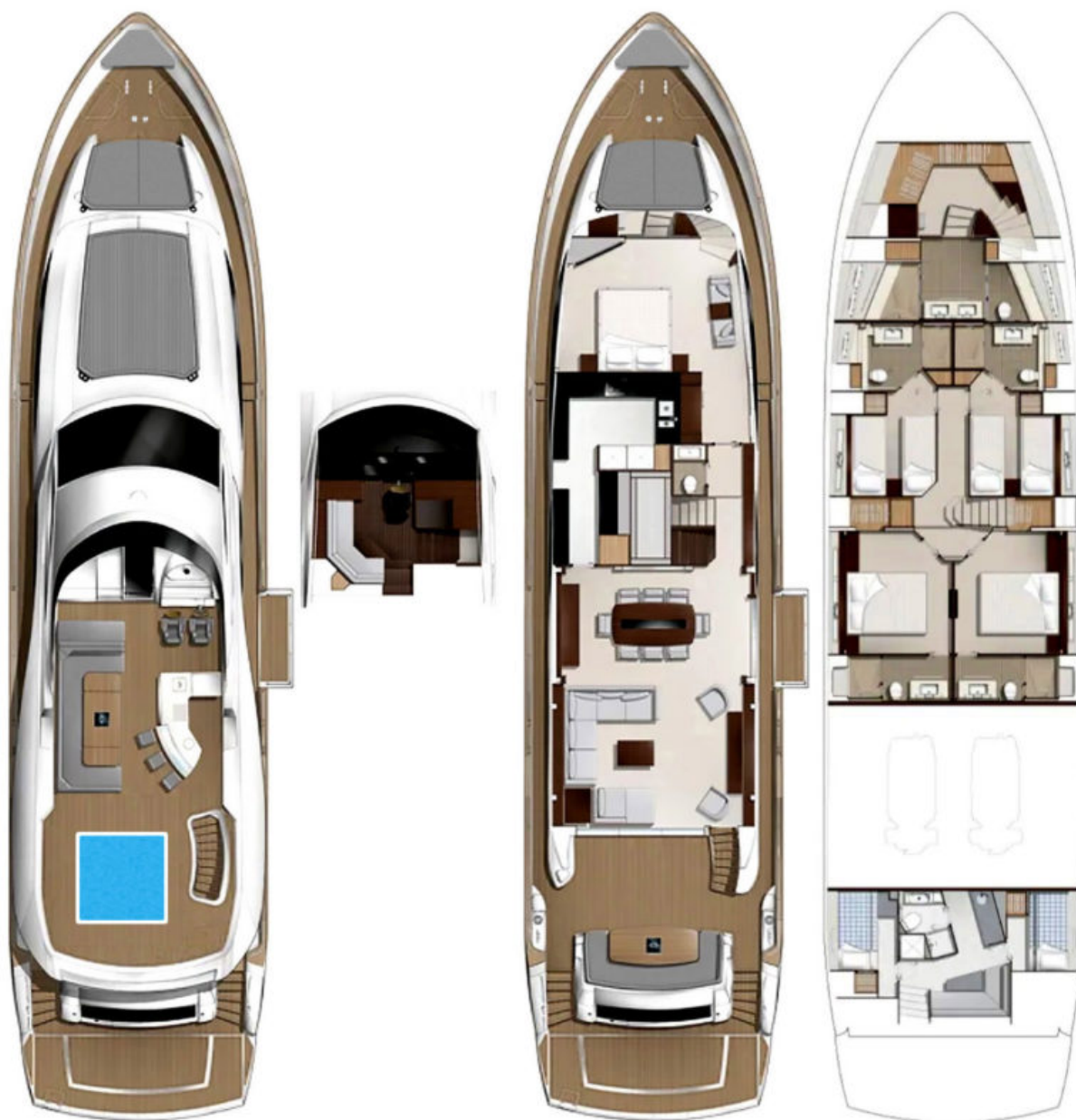
KARILLIAN & COMPANY, 95' (28.06m) Sunseeker Motoryacht, 2018

92.1 feet / 28.1 meters | Sunseeker | 2018